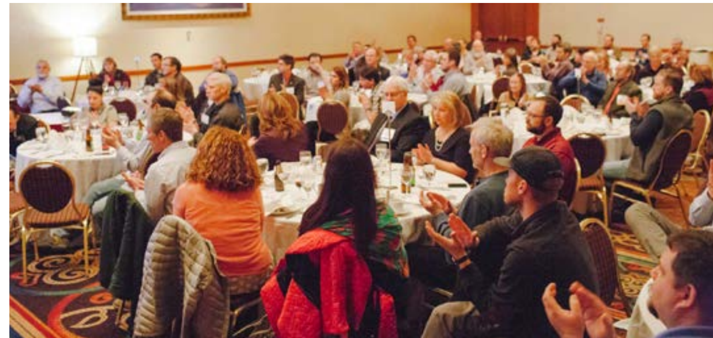
ASMC Awards Banquet

RDI is a software development, system integration, and GIS company with 215 employees. RDI has been a leader in GIS development since 1986 and has long been recognized by ESRI as a premium GIS company. Over the past 30 years, our projects have evolved with the technology and we continue to be at the forefront of GIS. However, the best testament of our high quality work is repeat business from government agencies, utilities, oil companies, and other major enterprises. Perhaps best of all, we are a local company (Alaska offices in Anchorage, Fairbanks, and Juneau) with national reach (lower 48 offices in Boise, Houston, Portland, and Minneapolis). ❖